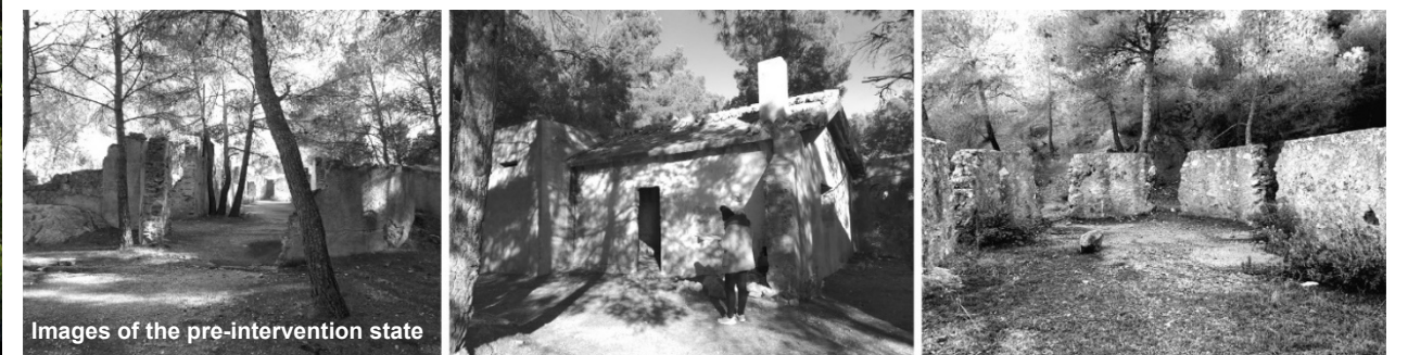
Images of the pre-intervention state

What has transcended to the present day has been the footprint of some of the building's walls, a water tank located in what would be the nose of the plane, the swimming pool pit and a nondescript and abandoned construction that was inserted at the beginning of the 80s to offer a restoration service.